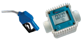
DEF NOZZLE AND METER