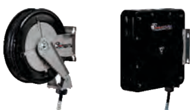
AUTOMATIC HOSE REEL