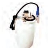
DEF DRUM DISPENSERS