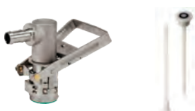
DEF VALVE & SUCTION KIT