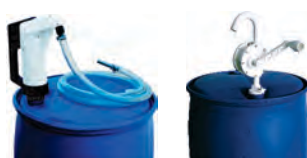
DEF MANUAL PUMPS